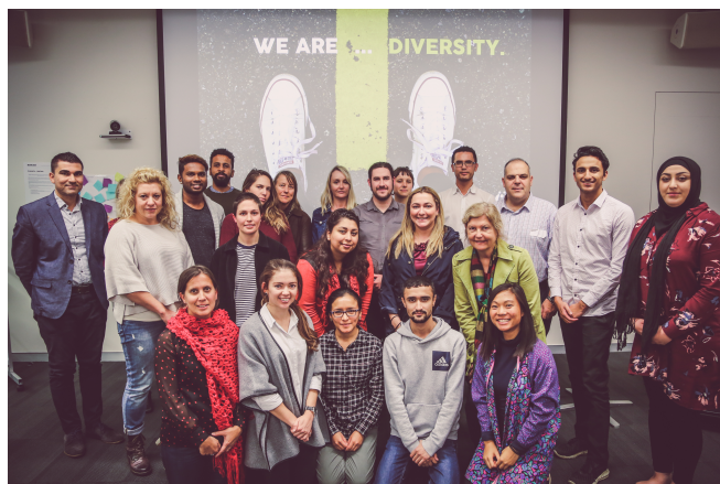
Participants at the May NYSF training at UNE Parramatta