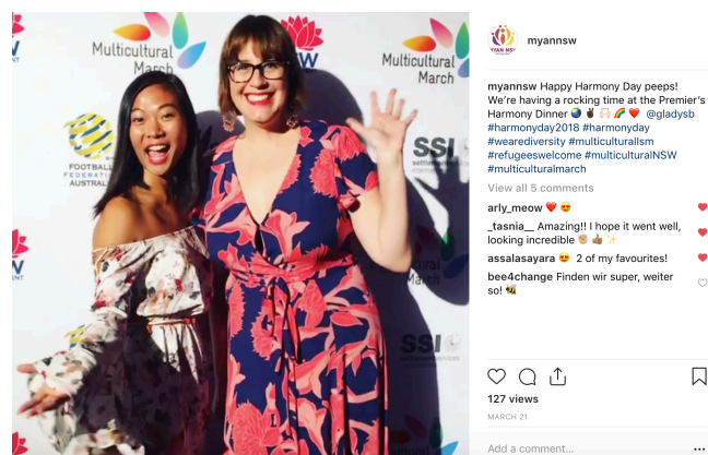
The MYAN NSW team at the Premier's Harmony Dinner