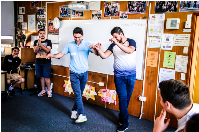
Youth facilitator and participants showcase Syrian dance

MYAN NSW recruited four peer facilitators from the MYA program to co-deliver the workshops along with the Youth Projects Officer. In the lead-up to these workshops, the peer facilitators were trained in facilitation techniques and met together to finalise the workshop content.