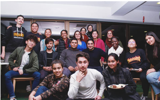
Multicultural Youth Ambassadors at a meetup

MYAN NSW's networks provide a huge range of opportunities in which MYAs participate. Many encountered their first public speaking engagement; attended a conference on a topic they are passionate about; or grew their social, civic and professional networks.