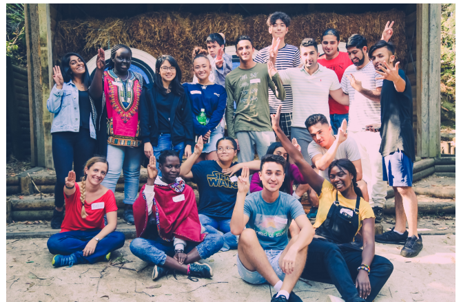
Staff and young people at MYAN's inaugural Leadership Camp

One of the highlights of the camp was the Saturday night Diversity Celebration, where MYAs showcased their cultural pride in the form of dress, song, dance and games. MYAN NSW provided a space of welcome, belonging and inclusion to passionate and diverse young leaders. More than building skills, the camp highlighted the importance of building long-lasting support networks and friendships, and created a safe space for it to occur.